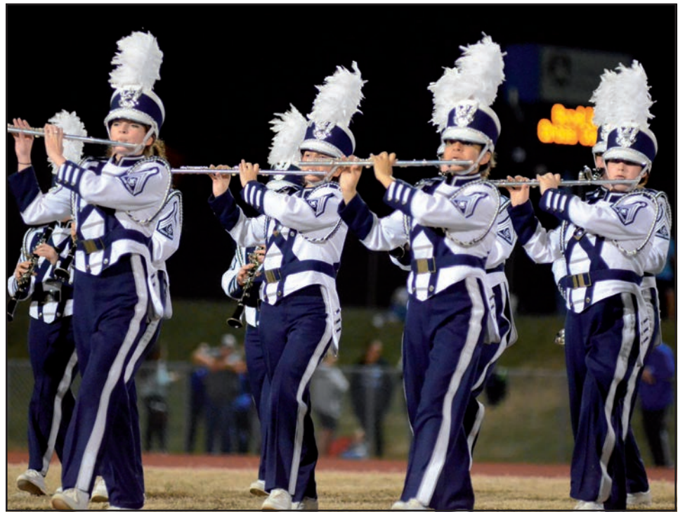
Union Grove's band marched during halftime of the Nov. 3 home game against Beckville. Two days prior, the band competed at the state military marching contest at Baylor's McClane Stadium in Waco. The band scored high enough in the preliminary round to earn one of five spots in the finals and went on to place fourth among the best 2A military bands in the state.