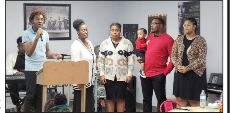
Jarvis Christian University Choir members sang for the Martin Luther King, Jr. celebration brunch.