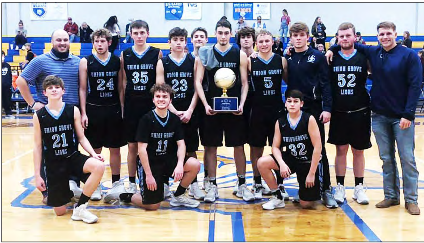
The Union Grove Lions will take their District Championship crown on the road Feb. 13 for a warmup game against Maud at 5pm, then the Lions will begin post-season play against Woden on Friday, Feb. 19, in Rusk. A time for the game was not available at presstime. The Lions - currently on a 7-game win streak - have a 17-8 overall record and are 8-1 in district place. At home this season the Lions have gone 10-1 and are 7-7 on the road. Thus far they have put up 4,450 points, while allowing 1,231.