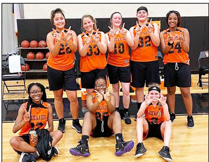
The 8th grade Gladewater Middle School girls basketball team went undefeated and won the district crown.

The Roughnecks held a slim lead going into the half before opening things up in the second. White Oak needed this win to have any chance of challenging Gladewater for the District Championship.