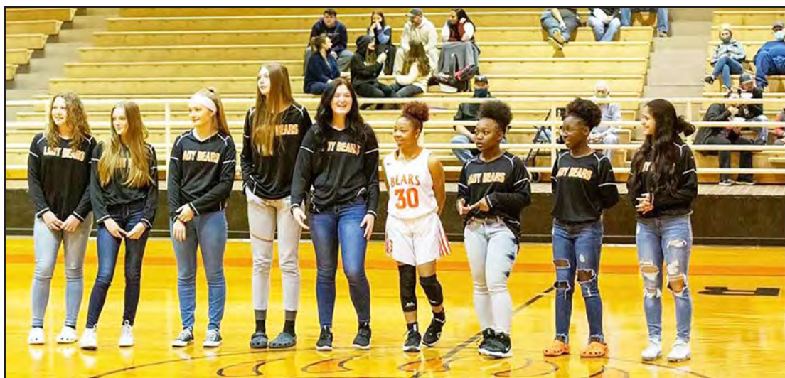
Congratulations to the GHS Junior Varsity Lady Bear team for an undefeated season and their District Championship.

There were 17 responses in Upshur County city limits including one grass fire, 14 medical assists, one gas leak and one shorted electrical equipment.