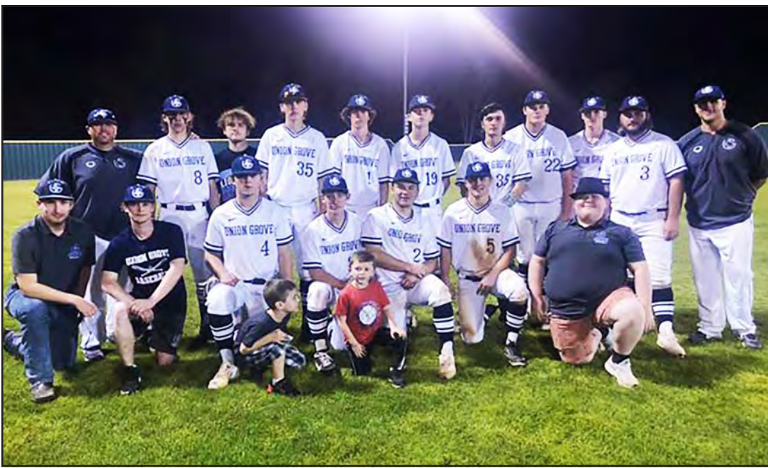
The Lion varsity baseball team is 7-0 in district play.

The Lions won the Journalism Team Championship and Top Speech Team honors. The One Act Play team also advanced.