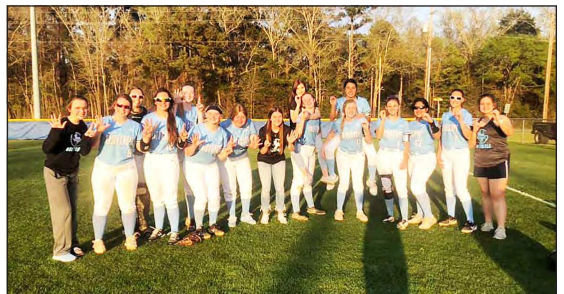
The Lady Lions are 6-0 in softball district play.

Gregg County Sherrif's Office (903) 236-8400