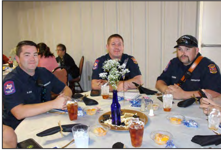
Gladewater Fire Department Representatives