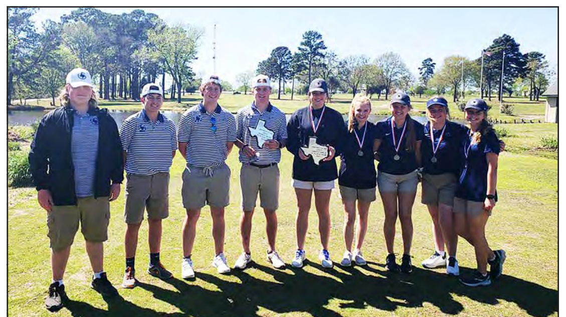
Both Union Grove's boys and girls golf teams advanced Monday to Regional competition.