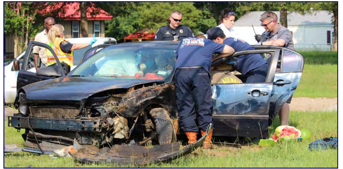
Gladeater firefighters and police officers responded to a wreck near the Round Up Rodeo grounds last Tuesday afternoon. Despite the severity of damage to the vehicle, the driver and passengers were reported to have no life threatening injuries.

DPS urges drivers to be aware as school year begins