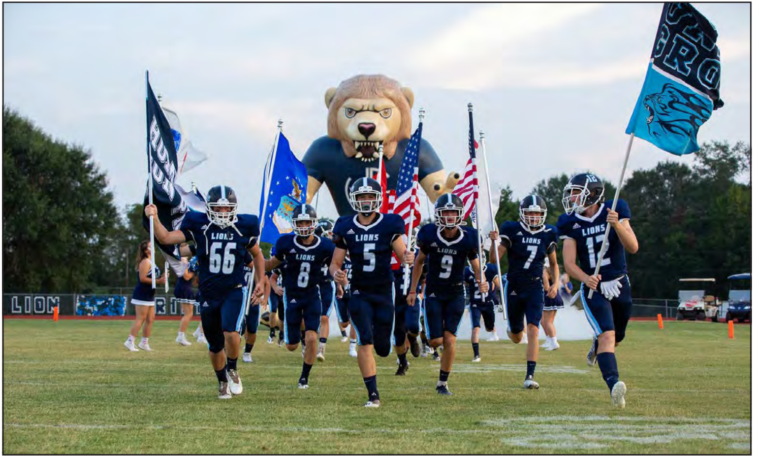
The Union Grove Lions will attempt to rebound from last Friday's loss to Queen City by traveling to Alba-Golden for a non-conference game with the Panthers on Sept. 10 at 7:30 p.m. The Lions dropped their home opener 57-12 to Queen City and are now 1-0, while Queen City's win made them 2-0 on the new season.