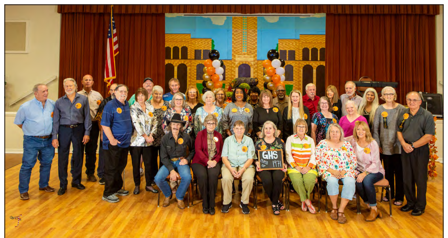
Bear alums from the Class of 1971 celebrated their 50th reunion at the All School Reunion on Sept. 25. The event, sponsored by the GHS Ex Students Association, was well attended.