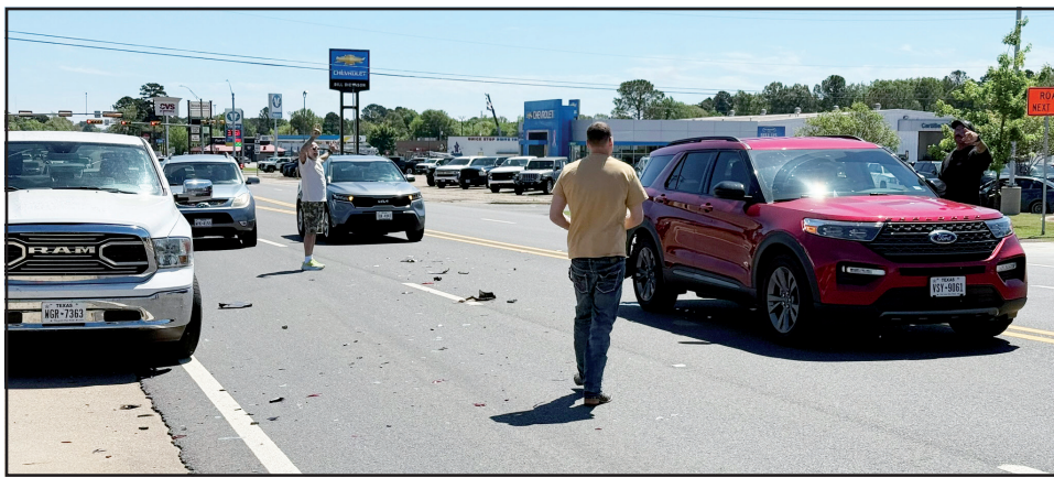
The 1100 block of East Broadway Ave. caught another set of drivers Monday afternoon. There were no apparent injuries after the rear-end collision, which involved multiple vehicles between McDonald’s and Chicken Express on Hwy. 80.