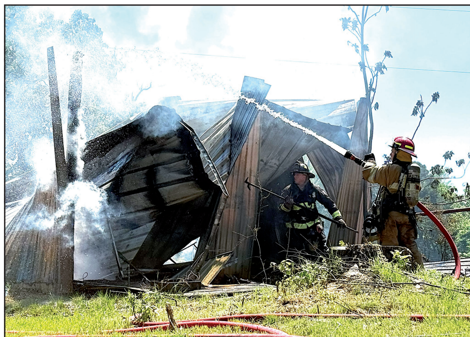
Gladewater Fire Department personnel respond to the scene of a barn fire in the 1200 block of Pine Hills Lane Monday afternoon, working alongside firefighters from Big Sandy Volunteer Fire Department. It was too early to pinpoint a cause April 6, but an unattended burn pile nearby appeared to be a likely culprit for the total loss of the structure. Emergency responders, assisted by Christus EMS and others, were dispatched shortly after noon.