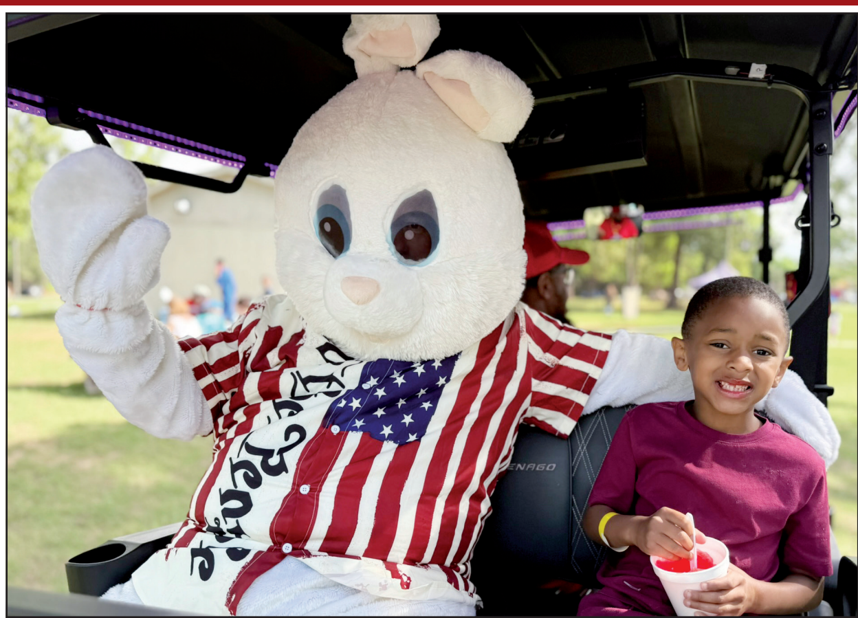
It took all of 36 seconds for local youngsters to scoop up their eggs at Lake Gladewater Sunday afternoon. A rainy Easter weekend forced volunteer organizers from Gladewater Thrive & Connect to reschedule Egg-stravaganza to Sunday afternoon, and they drew a healthy crowd, culminating in a final heat of "8 years-old and older" to close the celebration.

Stop at red lights and stop signs. Ride in the same direction as traffic and use bike lanes or ride as near as possible to the right-hand curb. Use hand signals for turns or stops.