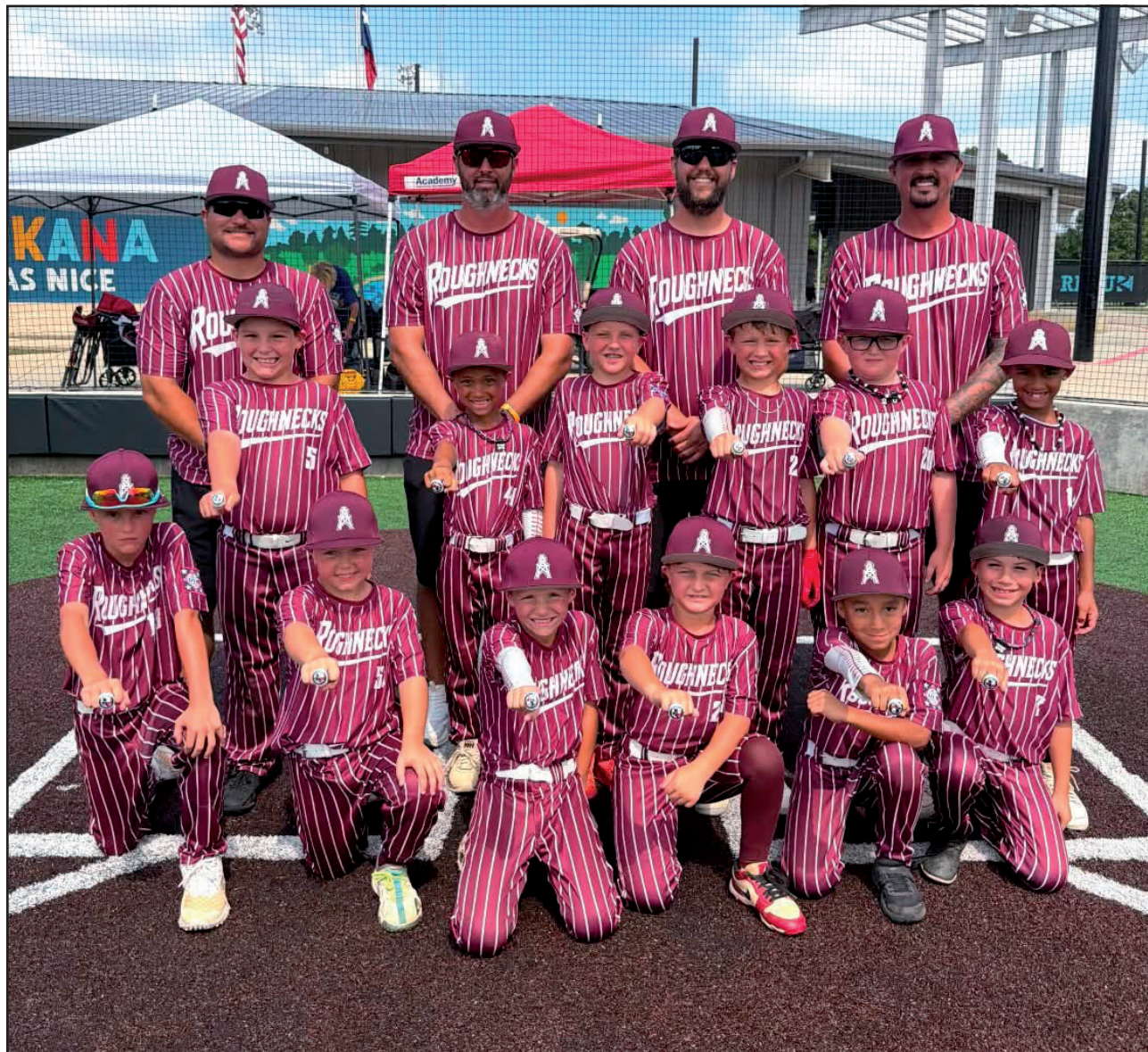
NORTH REGIONAL DIV 1 RUNNER-UPS 8U takes 2nd in Texarkana! Great season White Oak.

The Hogs are now 6-15 on the season and will next host the Beaumont Oil Barons for three games before traveling to Meridian for 3 games.